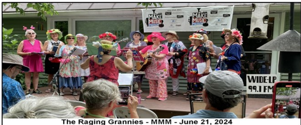
The Raging Grannies - MMM - June 21, 2024

we live in Midvale Heights, a community that has opportunities for connection! How grateful we can be that we have the Sequoya Branch Library, a forum where there are programs, classes, book groups and resources available to those who need a friend and those who can be a friend. The Friends of Sequoya exists to provide funds to make connections at Sequoya like Tai chi, sewing, and watercolor classes, children's programs and Saturday concerts. We are very grateful for your donations of books, DVDs and CDs which we sell to renew those funds. We accept donations at Sequoya Library every day but you can also bring them to the Friends of Sequoya Bookshop in Market Square on Mondays and Thursdays from 9 a.m. to noon. We request that large donations are brought to the shop or leave a message at 608-288-9848 so we can arrange a pick up. If you have any questions about donations or volunteering with the Friends of Sequoya, ask at the Sequoya Help Desk, come to the shop to talk with us on our donation days or leave a message on our shop phone: 608-288-9848. Upcoming sales at the Friends of Sequoya Shop are July 6, August 3 & 17, and September 7. Find us on Facebook: https://www.facebook.com/friendsofsequoyalibrary/ .